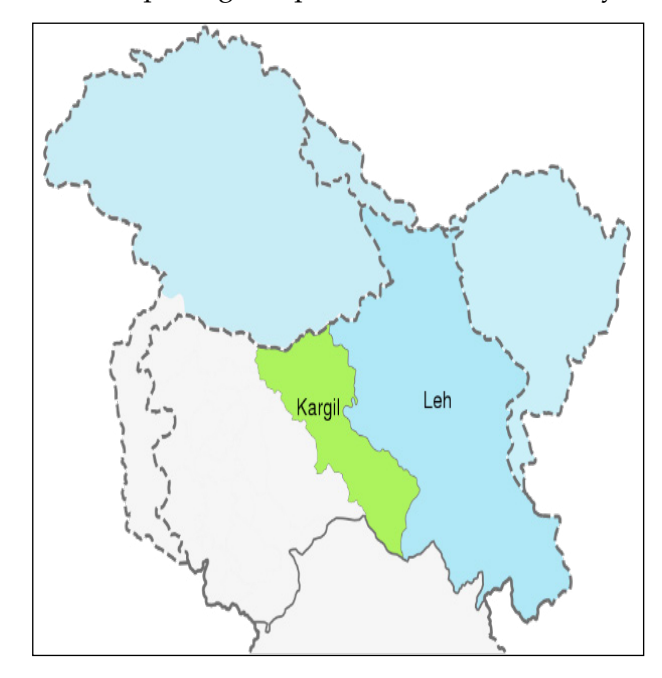
Fig. 1: Map of the study area

The selected study area represents a Himalayan cold desert Ladakh, its consist of two districts. One of the selected districts is a tourism hub Leh, while the other one is Kargil. Sample of 64 farmers have been taken, then 31 farmers from Leh and 33 farmers from Kargil have been selected by using proportional allocation method. The well-structured questionnaire was used in conducting the survey. The selected respondents read the questions by them and interviewer helped with interpreting the questions where necessary.