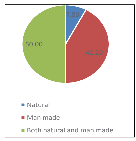
Fig. 3: Reasons for climate change

7.8% of the farmers believe that climate change occurred in the Ladakh Valley is due to natural reasons, 42.2% of the farmers said that it was due to man-made reasons, whereas, 50% of the farmers are of the view that it was due to both natural and man-made reasons.