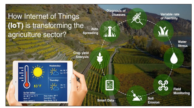
Fig. 2: Few Agro IoT areas for Smart Agriculture