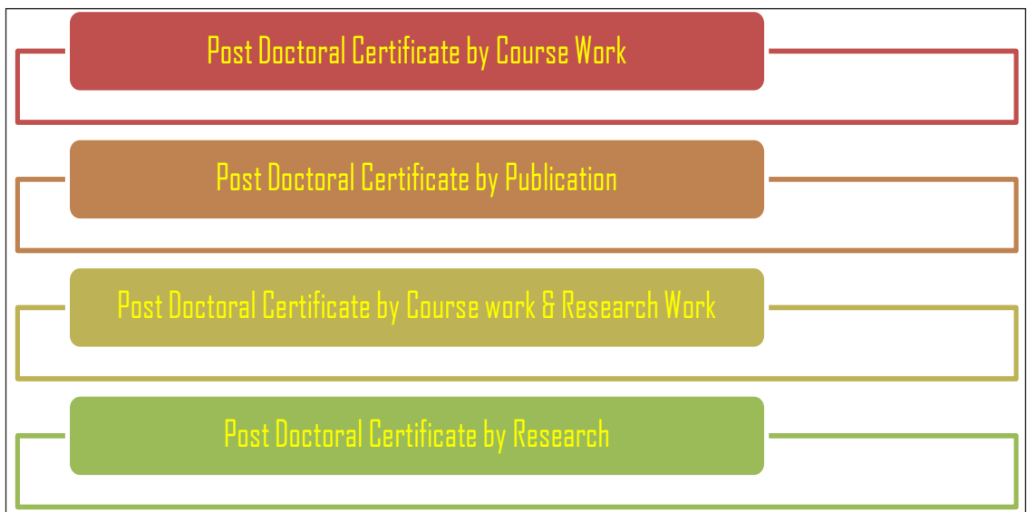
Fig. 1: Possible Post Doctoral Certificate with a variety

Therefore the Post Doctoral Certificate can be offered based on the need and demand of the candidates. Moreover, candidates with interested in publication or having publication can go with research/ publication mode. In contrast, candidate interested in learning new things can go with the coursework mode (refer Fig. 1 as well).